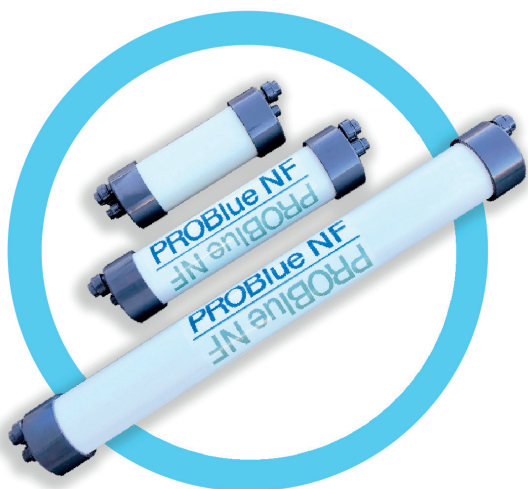
ProBlue NF Encapsulated nanofiltration membranes