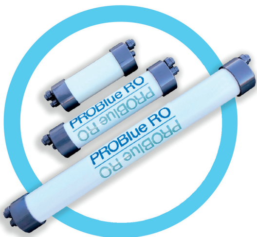
ProBlue RO Encapsulated reverse osmosis membranes