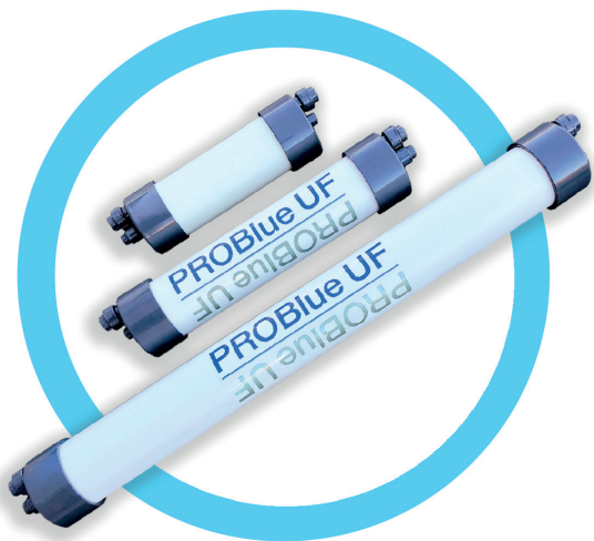
ProBlue UF Encapsulated ultrafiltration membranes