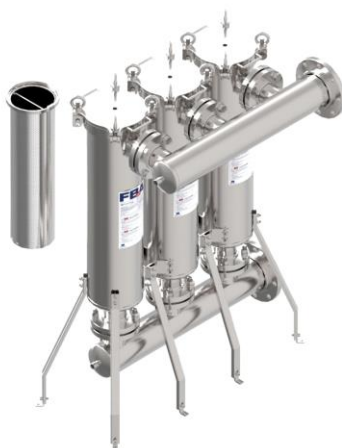
Approximate picture. Connections and measures choice will lead to the assembly of a product which could differ from those shown in figure